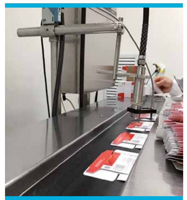
Legrand has modified its processes and best practices to include using GS1 unique identifiers and other valuable information encoded in the GS1 DataMatrix barcode on each dosage of Omeprazol.

One of the challenges during implementation was establishing automated systems to facilitate the control, traceability and safety of the drug preparation process. Higuera advises, "Many of the information systems are in the design and preparation phase, to achieve proper registration, control, labeling, dispensing and administration of the pharmaceutical service. We know that this takes time but is finally a process, which will improve over time."